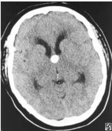
CT of Colloid Cyst

Intermittent and chronic obstructive hydrocephalus may result in headaches, nausea/vomiting or other neurological symptoms (eg blurred vision, seizures). Even with removal of the colloid cyst, chronic enlargement and scarring of the ventricles may be present resulting in persistent symptoms of raised intracranial pressure.